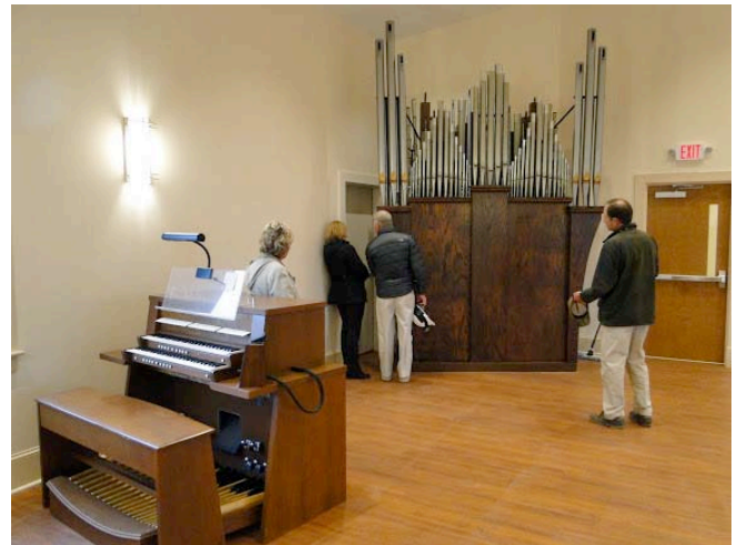
The organ pipes are admired. And the cross on the wall....?