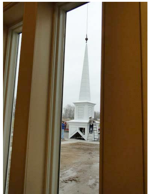
Before it goes aloft.

Attempts were made at singing Life High the Cross and a rousing rendition of the Doxology served as benediction to the project.