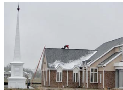
There he goes, across the roof