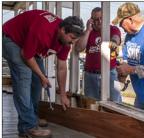
One of the many restoration projects completed during Operation Inasmuch 2015.